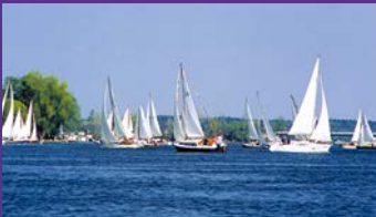
Excellent leisure possibilities in the region

The region offers a unique combination of the international flair of the Berlin metropolis and the fascinating nature and historical sights of Brandenburg. A singular club scene, renowned large events, more than 170 museums, 150 theatres as well as some 500 castles, churches and parks all attract visitors to the region. There are no limits to the sporting and leisure activities, among them golf, horse riding, water sports and flying.