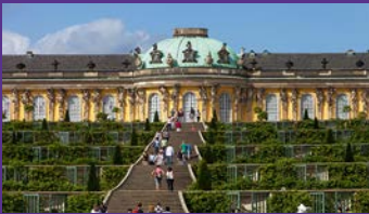
Schloss Sanssouci in Potsdam

Berlin-Brandenburg offers specific funding programmes for innovations, investments and the training of workers. Funding is provided by the European Union, the Federal Government and the states of Berlin and Brandenburg.