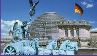
Quadriga in front of the Reichstag dome